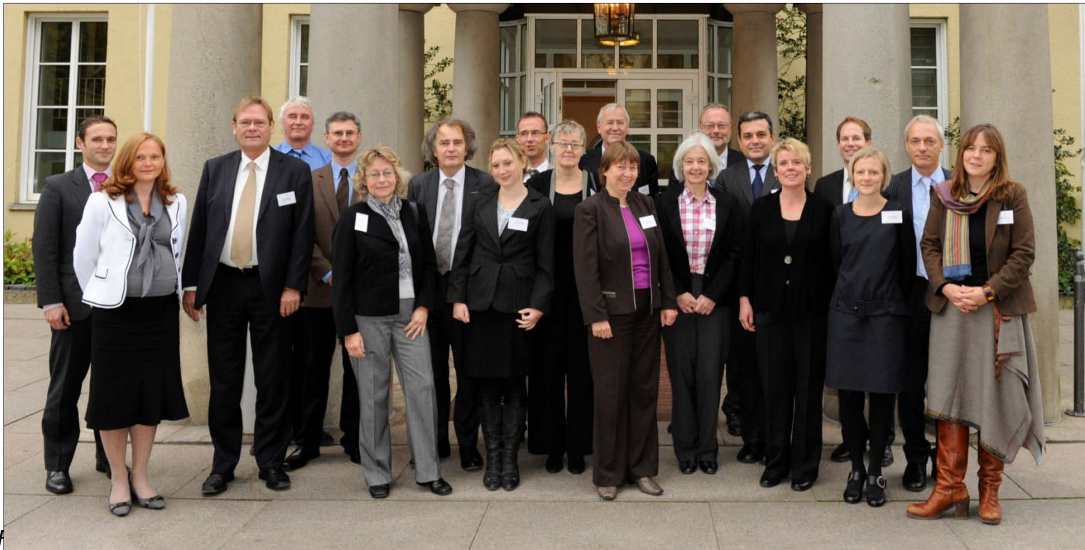
Petersberg October 2010

“To make a layer of scholarly and scientific content openly available on the Internet”